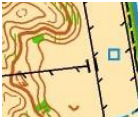
Queen Elizabeth Park - map extract