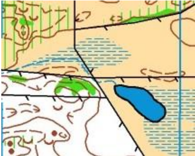
Prickly Sands - map extract